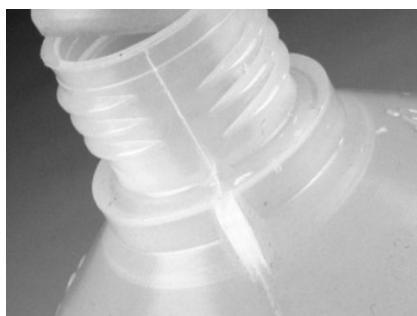
Potassium Ionic Strength Adjustment Buffer (ISAB) 500ml