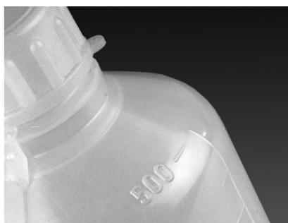
Potassium Standard Solution 1000ppm (500ml)