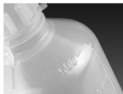
Lead Standard Solution 1000ppm (500ml)