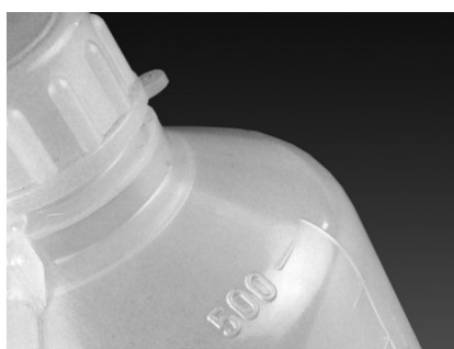
Lead Ionic Strength Adjustment Buffer (ISAB) 500ml