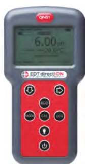
QP451 portable pH Meter