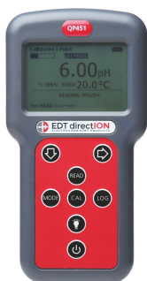
QP451 portable pH Meter