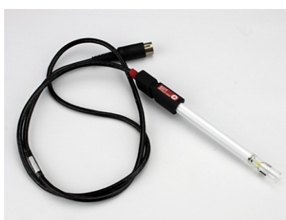
Glass Conductivity Cell K=1