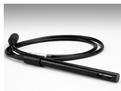
Polymer Conductivity Cell K=1