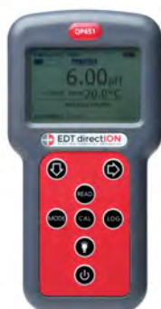
QP451 Portable pH Meter