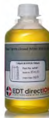
Buffer Solution pH 7 (Yellow) 500ml