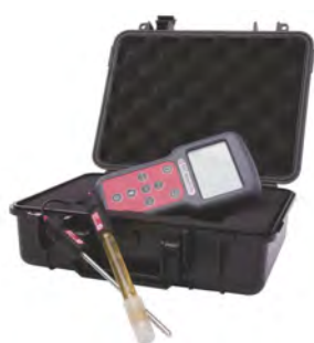
Series 4 Portable pH Meter Kit