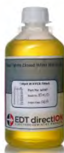
Buffer Solution pH7.00 (Yellow) 500ml