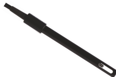
K=1 Polymer Conductivity Cell