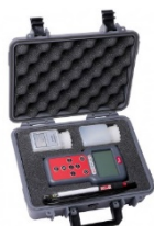
Hard Carry Case