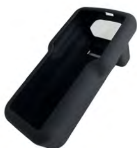
Rubber Boot/Stand for Series 4 Meters