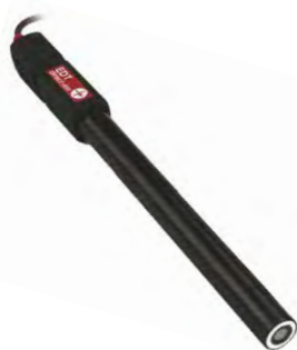
Fluoride Combination ISE